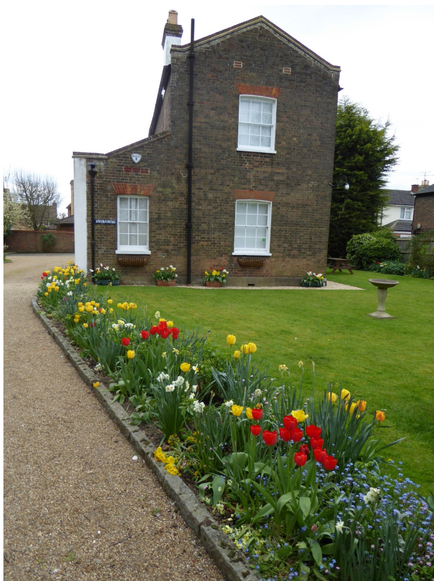
The museum garden looking splendid in the Spring

If you are receiving this newsletter as a paper copy, would you maybe consider changing to an electronic version? Naturally there are some of you for whom this is not an option and we will happily continue to send you a paper copy. Please contact the editor if you would like to switch.