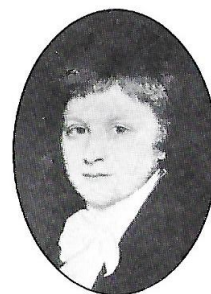
Lord Frederick Beauclerk 1827-50