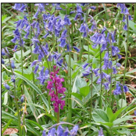
Bluebells and early purple orchid in Knott Wood – [John Fisher]