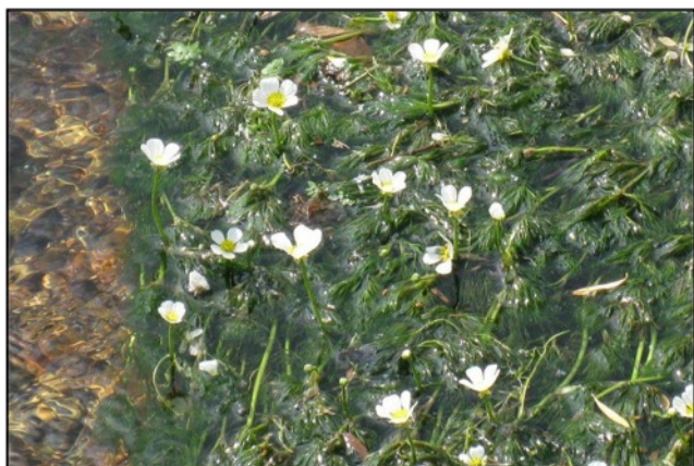
Water crowfoot. [Jane Gardiner]

Plenty of butterflies are being seen on sunny days such as whites, speckled woods, small tortoiseshells, peacocks, holly blues, orange tips, and brimstones. A few damsel flies are now about and a broad-bodied chaser dragonfly has been recorded recently. The river-fly monitors are finding a good variety of invertebrates in reasonable numbers.