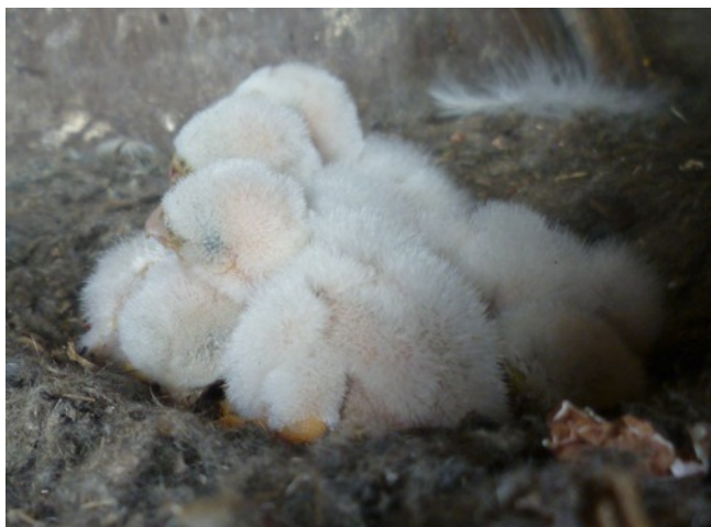
Kestrel brood of five – [John Fisher]

STOP PRESS 24 June 2019 – Five VVS barn owl boxes have young or eggs and one has four young kestrels. Late and all small broods but looks good. Just hoping for some warm dry days now.