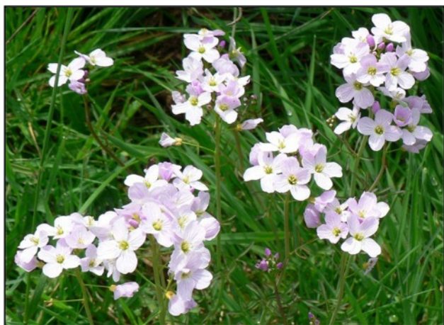
Lady's smock [Jane Gardiner]

I'm sure everyone has appreciated the displays of cow-parsley, ox-eye daisies and hawthorn blossom along the roadsides as well as the prolific buttercups in the meadows, which have also had good displays of ragged robin and lady's smock. Beside the river yellow flags have made bright splashes of colour and in the channel water crowfoot has done very well this year. Less pleasing southwards from Park Street is the strong growth of the invasive species of Japanese knotweed and Himalayan balsam which the Action group will be attacking in August and September (see Sue Frearson's note for details).