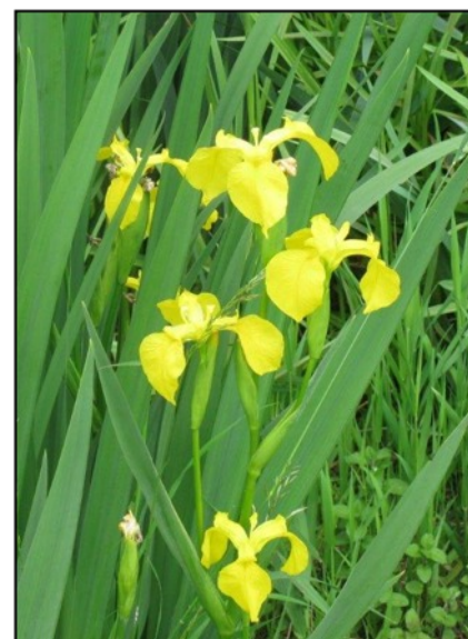
Yellow flag. [Jane Gardiner]

to know otters are using the Ver valley corridor. Fish records include brown trout, minnows, chub, bullheads and a barbel.