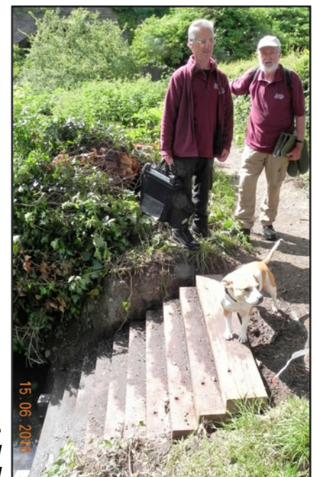
New dog steps at Sopwell Nunnery Green put in by the CMS volunteers to prevent erosion of the riverbank and undercutting of the footpath. [Sue Frearson]

10.00-12.00. Frogmore Pits (parking at Hyde Lane / Moor Mill) To clear back the permissive footpaths.