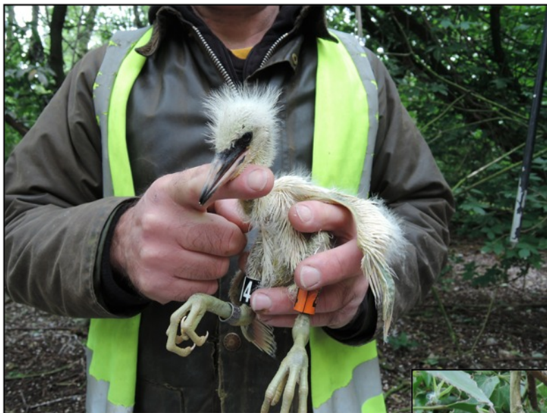
Little Egret with Colour Rings

One barn owl box has been used by a pair of kestrels and they have five young which we will be ringing at the end of June. Another has been used by stock doves and we were able to ring their two young. They have used the boxes in previous years but we never got the timing right to ring them. They are very ugly chicks but suppose their mothers love them!