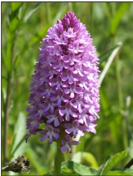
Pyramidal orchid.