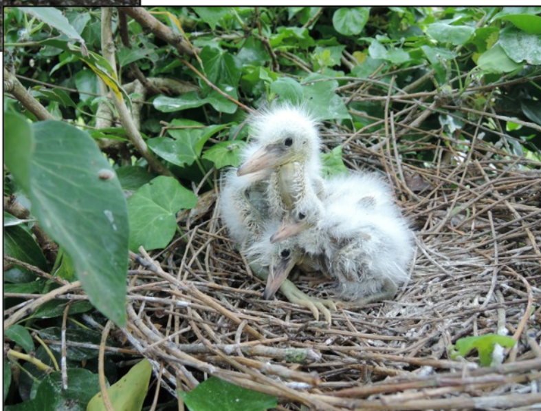
Verulamium little egret brood